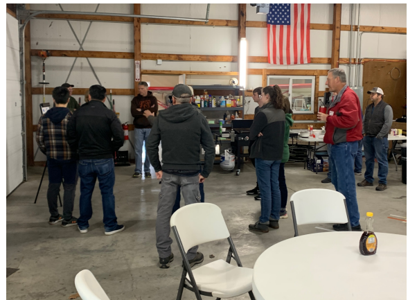
People gather for picking tasks from the "job list" and to work off some of those extra calories